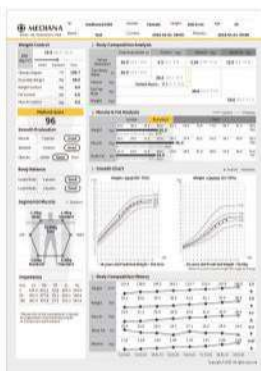
<Children Result Sheet>

* Due to continuing product innovation, Specifications may change without prior notice.